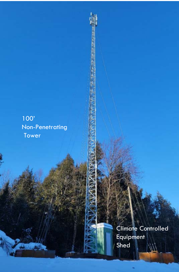
100' Non-Penetrating Tower